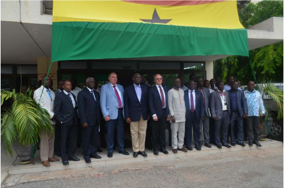
Officials from the IAEA and the Government of Ghana at the the INIR Phase 1 Mission Report handover ceremony in Accra, on 24 May 2017.

In addition, the IAEA offers the Integrated Nuclear Infrastructure Review (INIR) service — based on the Milestones Approach — to both embarking countries and those that are expanding their nuclear power programme. The INIR service helps to ensure that the infrastructure required for the safe, secure and sustainable use of nuclear power is developed and implemented in a responsible and orderly manner. Since its launch in 2009, the INIR service has been widely used by countries in the development or expansion of their nuclear power programmes.