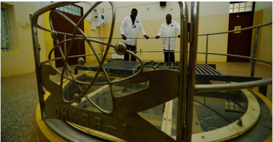
National Nuclear Research Institute, Ghana Atomic Energy Commission (GAEC), Accra, Ghana, January 2013

Ghana is one of these countries, with a research reactor operated by the National Nuclear Research Institute in Accra and trained local staff to run and oversee it. However, Ghana is a lower-middle income country 6 , which means that it is less resourced than an upper-middle income country and has more challenges related to providing its citizens with essential services such as water and electricity. Given the political commitment and the significant financial and human resource investment required by a country embarking on nuclear power, Ghana's successful completion of key foundational steps towards producing nuclear power is noteworthy and provides valuable lessons and best practices for other countries. This case study describes the path followed and the activities implemented by Ghana to complete the first phase and successfully transition into Phase 2 of the IAEA Milestones Approach. Key aspects of Ghana's implementation of its programme and lessons learned are described. Sharing these key aspects and lessons learned could benefit other countries interested in or already embarking on new nuclear power programmes.