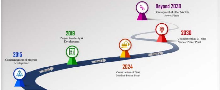
Roadmap of Ghana's Nuclear Power Programme