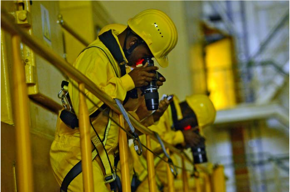
Safeguards comprehensive training exercise at Dukovany NPP, Czech Republic, 11 June 2015

programme and that all nuclear material is accounted for and protected. By concluding a comprehensive safeguards agreement with the IAEA, the country undertakes to accept IAEA safeguards on all nuclear material in all peaceful nuclear activities within its territory, under its jurisdiction or carried out under its control anywhere. This also requires the development of the appropriate culture, systems and practices to ensure that all staff are aware of their responsibilities and of the importance of their actions.