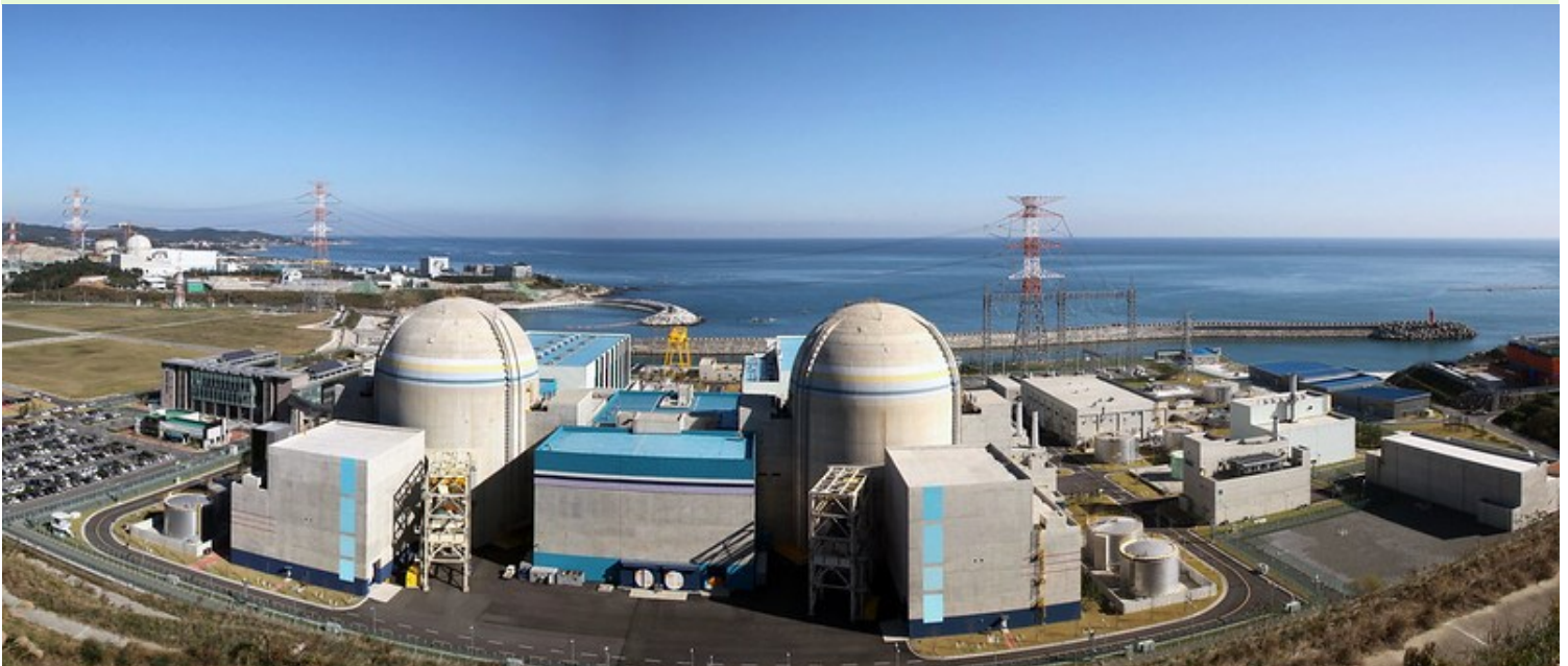
Unit 1-2 of Korea Shin-Kori Nuclear Power Plant.

It was also noted that a regular review conference and events on its margin, such as cooperative regional exercises or a one off training, will effectively support implementation and universalization of the Amendment.