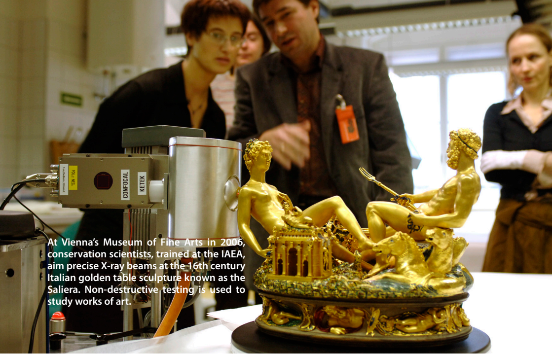
At Vienna's Museum of Fine Arts in 2006, conservation scientists, trained at the IAEA, aim precise X-ray beams at the 16th century Italian golden table sculpture known as the Saliera. Non-destructive testing is used to study works of art.