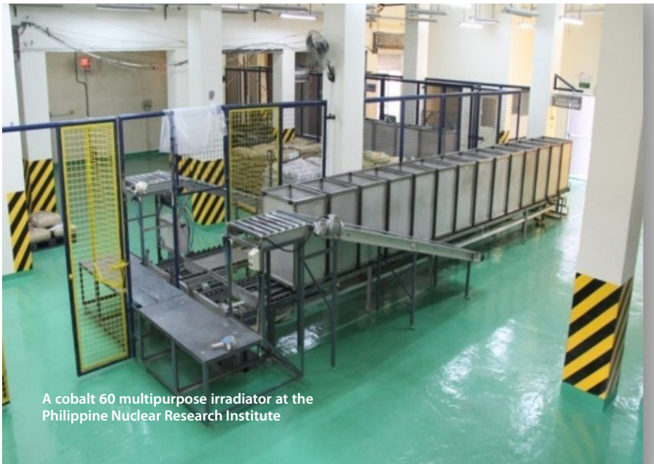
A cobalt 60 multipurpose irradiator at the Philippine Nuclear Research Institute