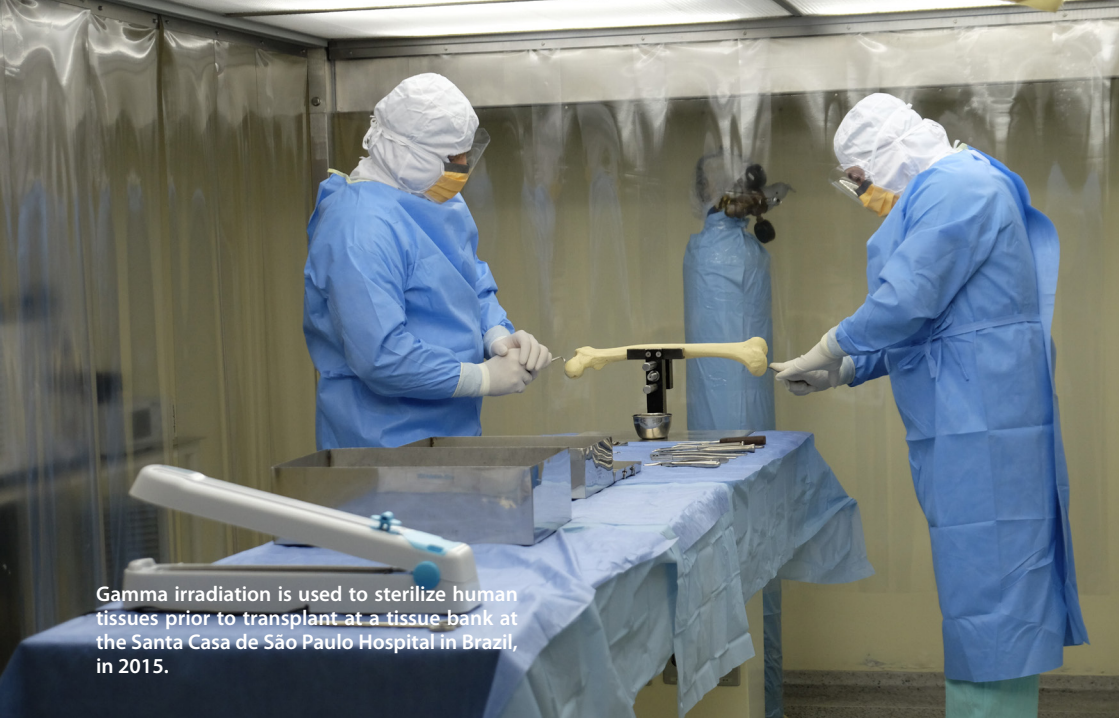
Gamma irradiation is used to sterilize human tissues prior to transplant at a tissue bank at the Santa Casa de São Paulo Hospital in Brazil, in 2015.